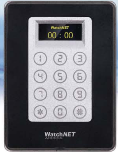
WAC-1D2T-MICRO (Built-in EM/HID Proximity Reader)